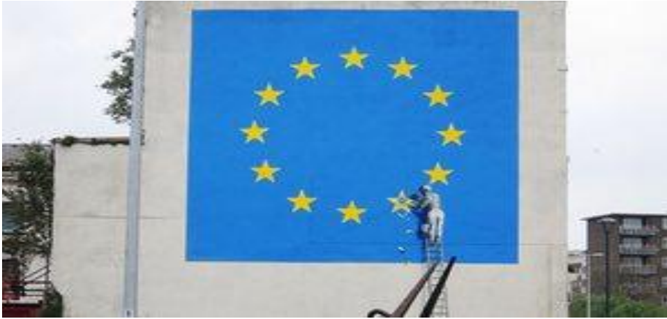
Figure 2. Banksy Brexit mural of man chipping away at EU flag appears in Dover (Petersen, 2017).

who uses a chisel to detach a star from the EU flag. The painting is located in Dover, southern England.