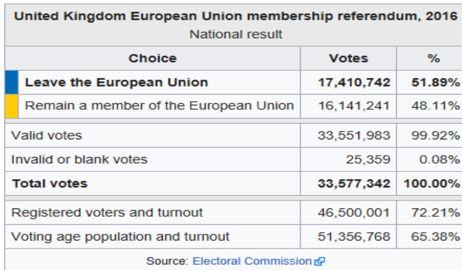
Figure 1. The referendum in Great Britain, 2016 (Electoral Commission, https://www.electoralcommission.org.uk ).